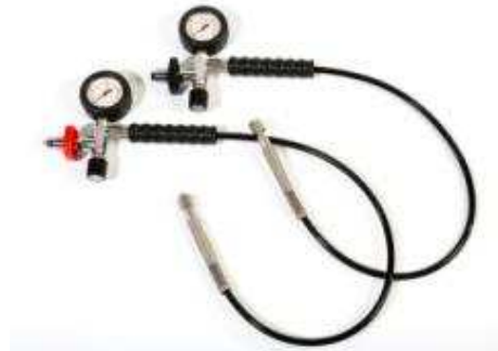
Filling device PN200 (black) and PN300 (red)