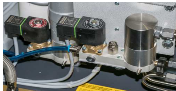
B-DRAIN Automatic condensate drain system

For petrol version, the automatic condensate drain system is supplied without control!