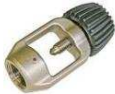
International filling connector