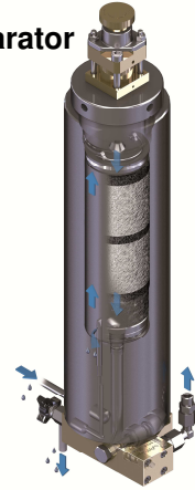
Purification System P31/350