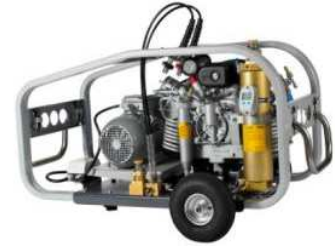
MARINER-E with trolley

The trolley provides an easy and convenient mode of transport for mobile compressor units. Fitted with pneumatic tires, the trolley maximizes mobility.