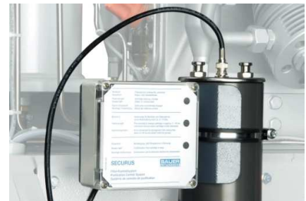
SECURUS Filter Cartridge Monitoring System

Only available with P41 and only for MARINER250-E!