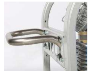
Crash frame incl. handles

The corrosion-resistant crash frame provides additional protection for the unit and can accommodate additional accessories such as a compressor control or a larger filter system. The handles make moving the unit easy and convenient.